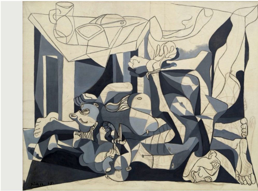
Pablo Picasso (1881-1973), The Charnel House , 1944-45, 199.8 × 250.1 cm, Museum of Modern Art, New York