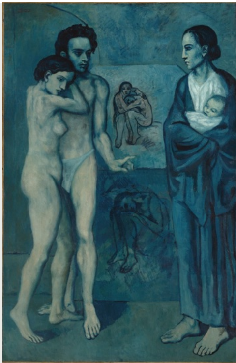
Pablo Picasso (1881-1973), La Vie , 1903, 196.5 × 129.2 cm, Cleveland Museum of Art