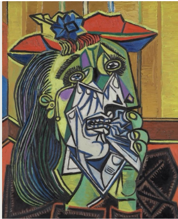
Pablo Picasso (1881-1973), Weeping Woman , 1937, 60 × 49 cm, Tate Modern, London