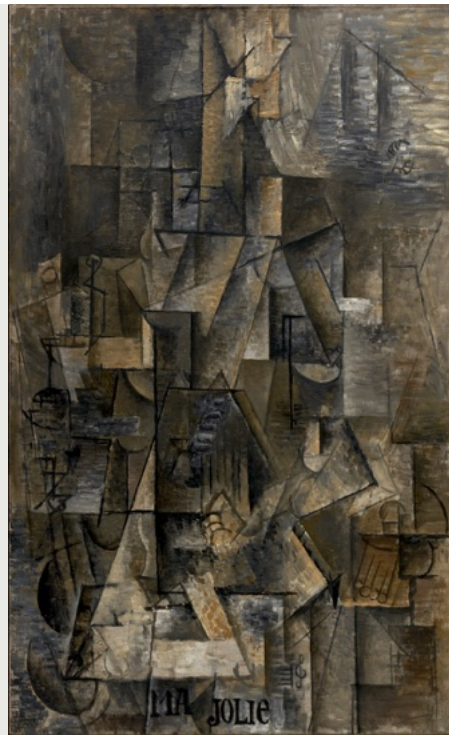
Pablo Picasso (1881-1973), Ma Jolie , 1911-12, 100 × 64.5 cm, Museum of Modern Art, New York