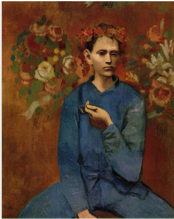
Pablo Picasso (1881-1973), Boy with a Pipe , 1905, 100 × 81.3 cm, Private Collection