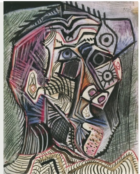
Pablo Picasso (1881-1973), Self-Portrait Facing Death (age 90) , 1972, 65.7 × 50.5 cm, Fuji Television Gallery, Tokyo

Pablo Picasso (1881-1973), Self-Portrait (age 15) , 1896, 32.7 × 23.6 cm, Museu Picasso, Barcelona