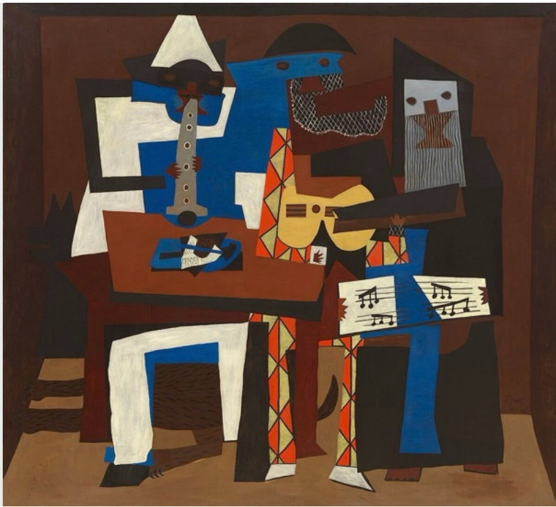
Pablo Picasso (1881-1973), Three Musicians , 1921, 200.7 × 222.9 cm, Museum of Modern Art, New York