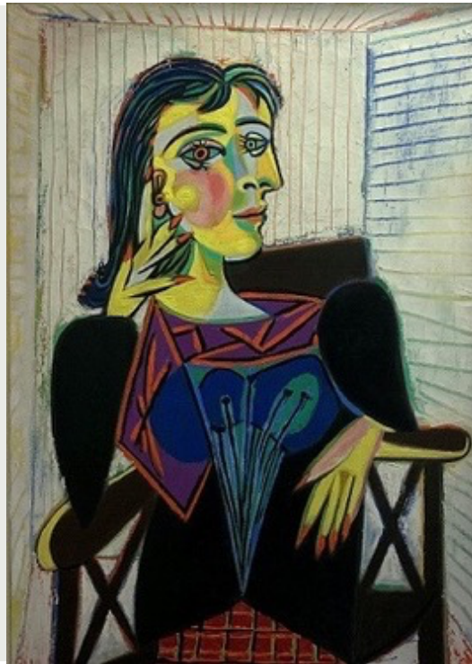
Pablo Picasso (1881-1973), Portrait of Dora Maar , 1937, 92 × 65 cm, Musée Picasso, Paris