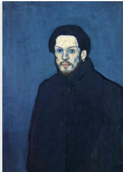
Pablo Picasso (1881-1973), Self-Portrait (age 20) , 1901, 81 × 60 cm, Musée Picasso, Paris