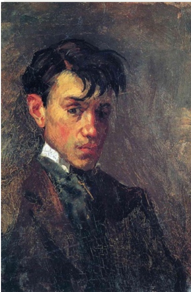
Pablo Picasso (1881-1973) Self-Portrait (age 15) , 1896, 32.7 × 23.6 cm, Museu Picasso, Barcelona