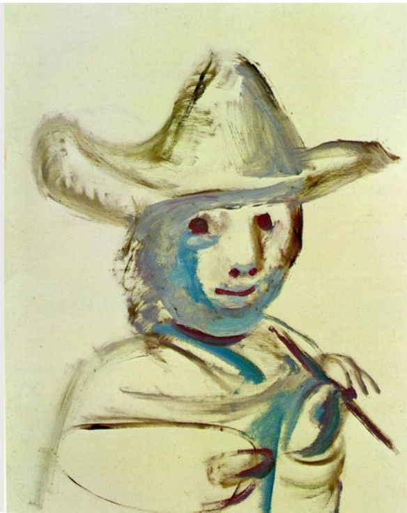
Pablo Picasso (1881-1973), The Young Painter , 1972, 91 × 72.5 cm, Musée Picasso, Paris