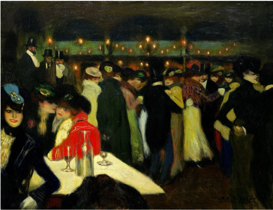
Pablo Picasso (1881-1973), Le Moulin de la Galette , 1900, 88.2 × 115.5 cm, Solomon R. Guggenheim Museum, New York