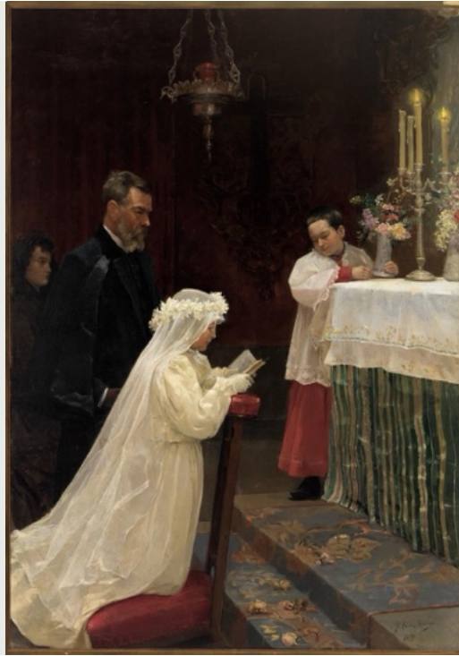
Pablo Picasso (1881-1973), First Communion , 1896, 166 × 118 cm, Museu Picasso, Barcelona